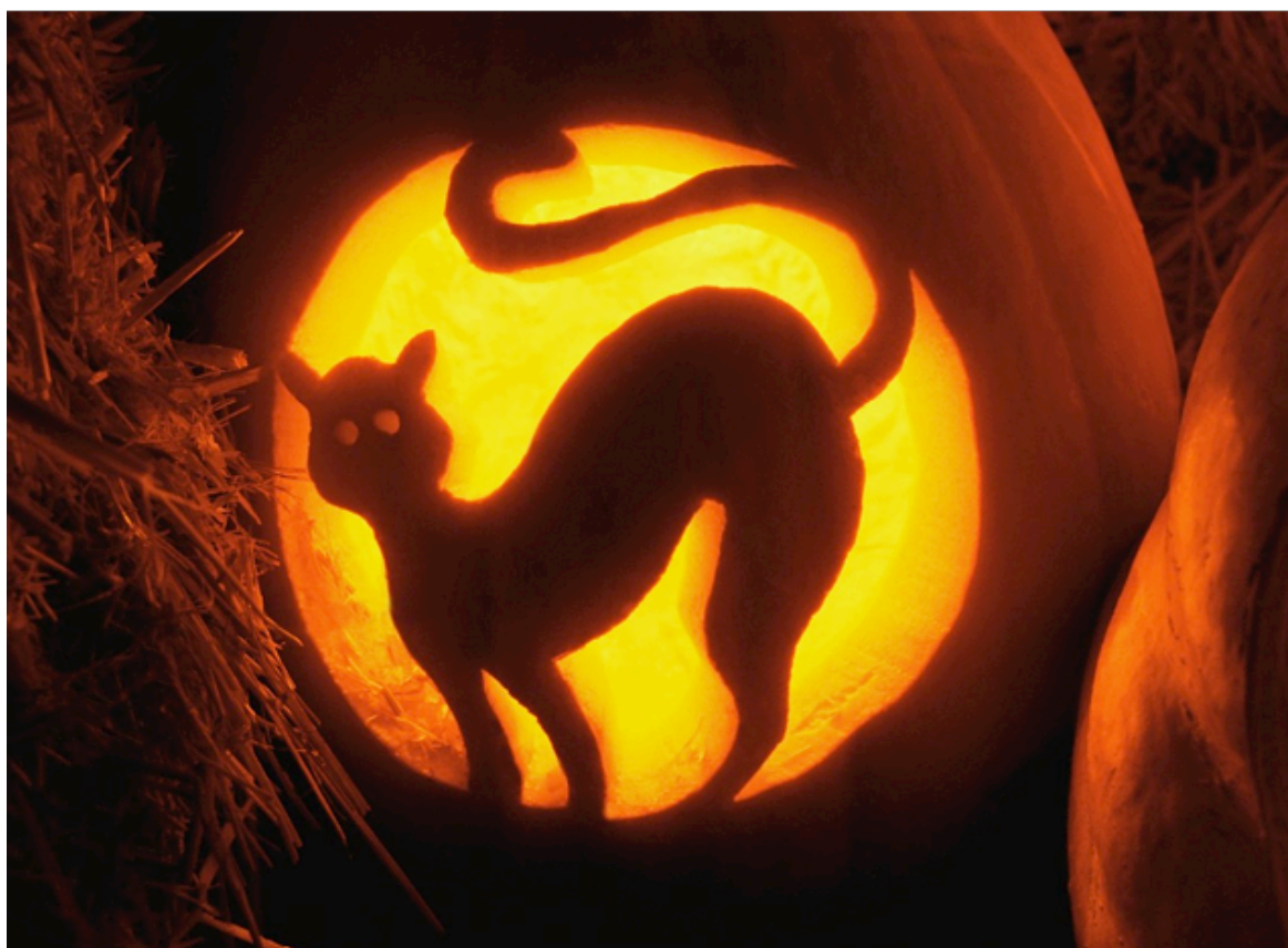
Not So Scary!